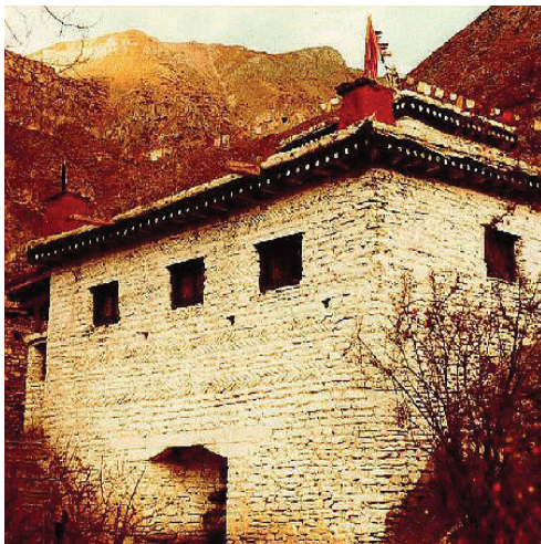
The "Temple Of Miraculous Fire" at Muktinath, Nepal. Photo by Ken Street (Nov. 1979).

[For more on this subject, please read our tract The Temple Of Miraculous Fire .]